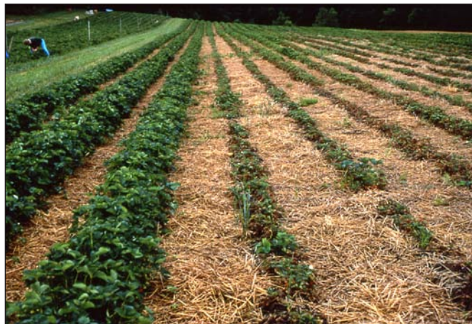
Figure 1. Strawberry field affected with red stele root rot. Susceptible variety on right, and resistant variety on left.

The most reliable symptom of red stele is found within the roots and may be observed by gently digging up a few plants that are just beginning to wilt, taking care to preserve the root system. Plants with red stele usually have few fine