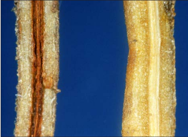
Figure 3. Section of an infected strawberry root (left) showing discoloration from red stele disease. Healthy root on right.

lateral roots so the main fleshy roots have a “rat-tail” appearance. During intermediate stages of disease development, these fleshy roots will be white near the crown of the plant but will show a dark rot progressing upward from the tips. When the white outer portion of the root just above this rotten zone is peeled off or sliced through, the root core (or stele) will appear to be dark red (Figure 3). It may be necessary to examine several rotting roots before finding a red stele, but this symptom is very distinctive and is diagnostic for the disease. Reddened steles are relatively difficult to find after harvest because most infected roots have died and begun to decay by then.