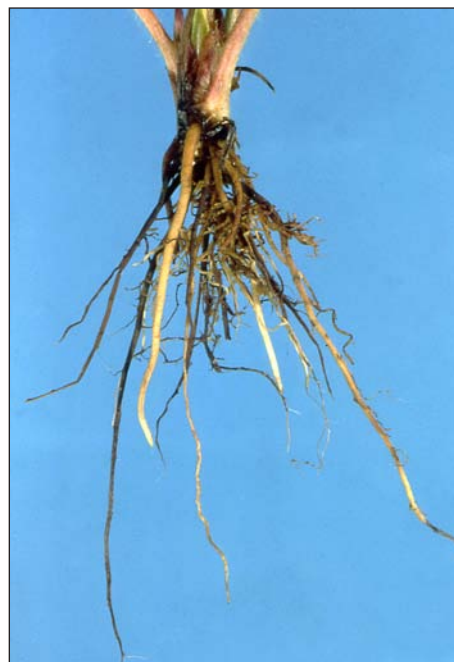
Figure 2. Strawberry root system affected by red stele.